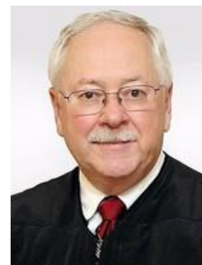
Chief Judge Jerome B. Simandle

A lawyer’s sentencing memorandum is very important to Judge Simandle. It’s a lawyer’s first opportunity to make a good impression with him. “Don’t waste your time with the first five pages using boilerplate citations,” he advises. “Put the important stuff in these first five pages. Don’t make it too long. I read every word. Don’t submit a sentencing memorandum late or out of time. Don’t submit character letters that lack credibility.” Judge Simandle says that it’s a good idea to quote from the better letters and attach them as Exhibit A, with the rest of the letters as Exhibit B, leaving out the ones that are worthless or counterproductive. While he allows a few live witnesses, he says, “Less is more.” He may ask the witness, “Have you spoken to the defendant about his crime?”