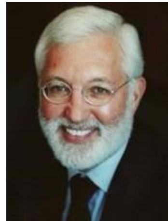
U.S. District Judge Jed Rakoff

Asked what a lawyer can do when he or she has a client who has been convicted of an exceptionally heinous offense, Judge Jed Rakoff of the Southern District of New York in Manhattan contends that "there generally is something good to be said about everyone. I don't know a single judge who doesn't recognize that he has a human being in front of him being sentenced."