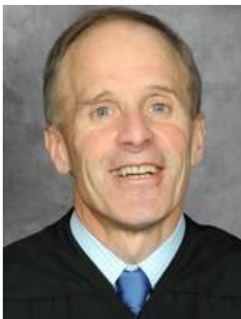
U.S. District Judge James S. Gwin

On appeal, the government objected to the polling, challenging the judge's use of the jury poll.