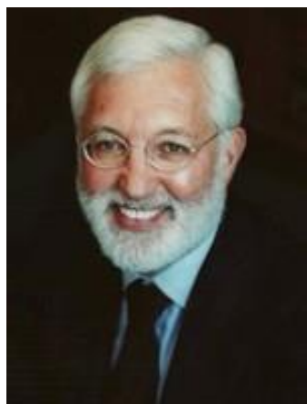
U.S. District Judge Jed Rakoff

Senior Judge Jed Rakoff of the Southern District of New York emphasizes how important it is to "know your judge." If you are not familiar with him or her, ask other lawyers, particularly the federal defender in the district. A judge's former law clerks are another good source of information. One of the things that you may want to ask them is whether the judge reads sentencing memos and character letters, and how long those letters should be.