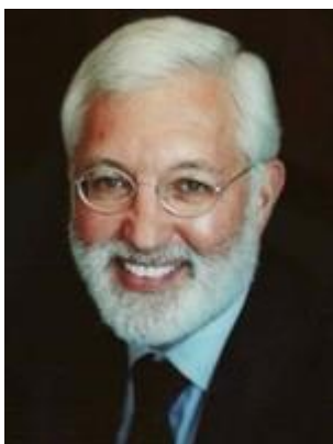
U.S. District Judge Jed Rakoff

In this article, I share more information about the judges' suggestions for having an impact in their courtrooms.